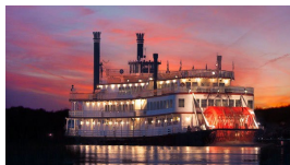
BB RIVER BOAT Captain's Lunch Tour

Cincinnati's Central Riverfront is an outstanding riverfront facility. Located along the shore of the Ohio River just south of downtown Cincinnati, this mile-long linear park features many different spaces serving all segments of the region's population. Along with a unique design, it features award winning landscaping, a performance pavilion, concessions, an outdoor skating rink, eight outdoor tennis courts, three sand volleyball courts, a world class playground, a dynamic water feature, and many other attractions.