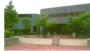
Black Cultural Museum

NATIONAL AFRO-AMERICAN MUSEUM & CULTURAL CENTER in Wilberforce Ohio Permanent and changing exhibits feature African American history and culture, from African origins to the present day. Artifacts, art, manuscripts and library materials reflecting the traditions of African-Americans are housed at this complex.